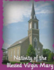
Nativity of the Blessed Virgin Mary