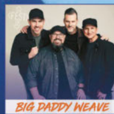
BIG DADDY WEAVE