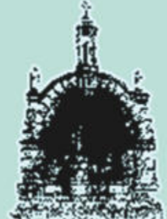
Our Lady of Lourdes Shrine - 1881 -