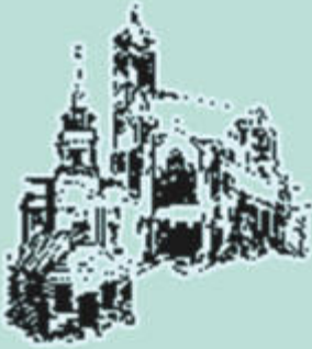
Assumption Grotto Parish - 1832 -