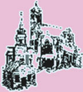
Assumption Grotto Parish - 1832 -