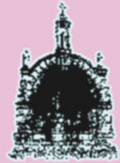
Our Lady of Lourdes Shrine - 1881 -