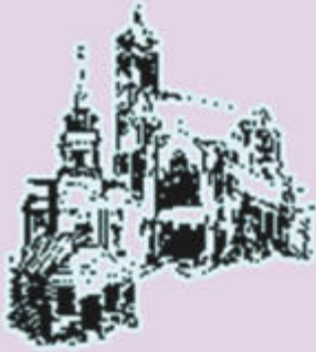
Assumption Grotto Parish - 1832 -