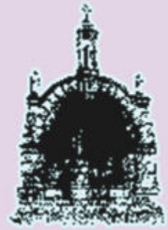
Our Lady of Lourdes Shrine - 1881 -