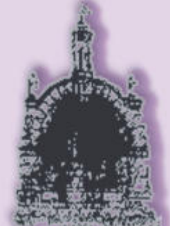
Our Lady of Lourdes Shrine - 1881 -