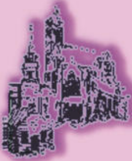
Assumption Grotto Parish - 1832 -