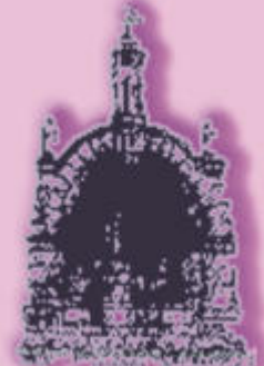
Our Lady of Lourdes Shrine - 1881 -