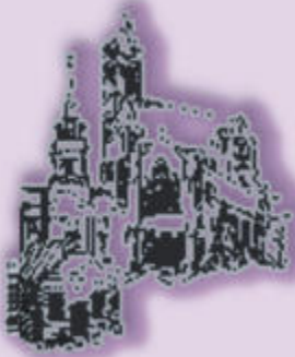
Assumption Grotto Parish - 1832 -