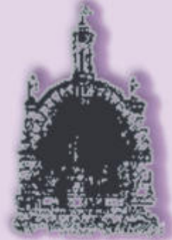
Our Lady of Lourdes Shrine - 1881 -