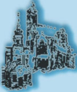
Assumption Grotto Parish - 1832 -