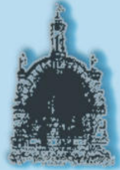
Our Lady of Lourdes Shrine - 1881 -