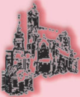
Assumption Grotto Parish - 1832 -