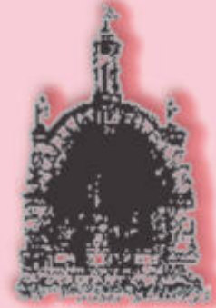
Our Lady of Lourdes Shrine - 1881 -