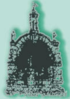
Our Lady of Lourdes Shrine - 1881 -