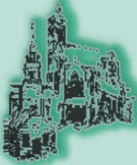
Assumption Grotto Parish - 1832 -