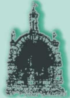
Our Lady of Lourdes Shrine - 1881 -