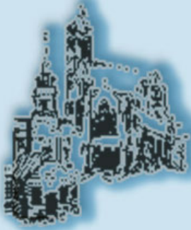
Assumption Grotto Parish - 1832 -