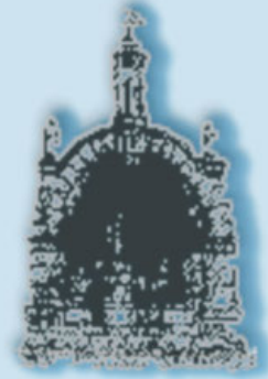
Our Lady of Lourdes Shrine - 1881 -