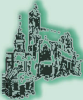
Assumption Grotto Parish - 1832 -