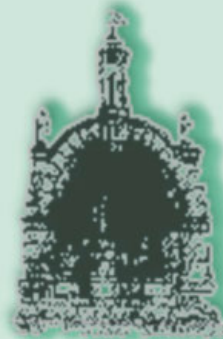
Our Lady of Lourdes Shrine - 1881 -