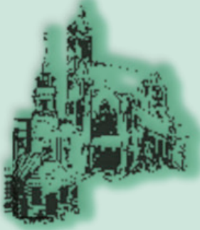
Assumption Grotto Parish Est. 1832