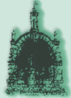
Our Lady of Lourdes Shrine Est. 1881