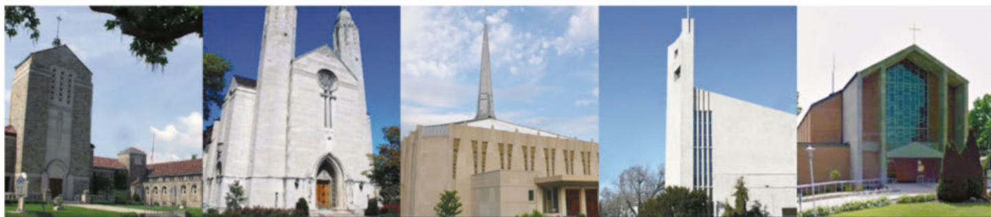
CHURCH OF THE RESURRECTION