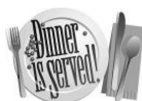
TABLE OF PLENTY WILL BEGIN AGAIN ON TUESDAY, JANUARY 11th (ALWAYS THE SECOND TUESDAY OF THE

MONTH), 5-6:00pm. Our first group who is hosting is our 2022 Confirmation Candidates. Not sure what the menu is?