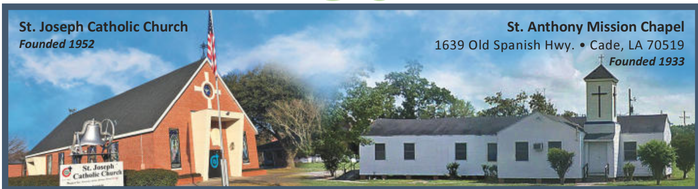
St. Joseph Catholic Church Founded 1952