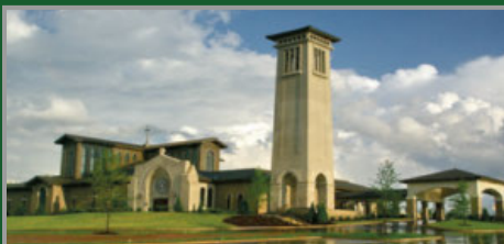
HOLY SPIRIT CATHOLIC CHURCH 733 James I Harrison, Jr. Parkway E., Tuscaloosa, AL 35405

Holy Spirit Catholic Parish is a faith community, centered in Jesus Christ, empowered by the Holy Spirit to proclaim God's love and the Gospel message through word and action to all.