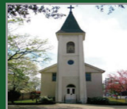
St. John The Baptist Catholic Church 800 Lurleen B Wallace Blvd N, Tuscaloosa, AL 35401 (Mailing: 733 James I Harrison Jr. Pkwy E; Tuscaloosa, AL 35405)

Saturday.....5:00 PM Sunday.....8:45 AM and 11:00 AM Nursery available (up to age 5) during 8:45 & 11 AM Masses Misa en Espanol (cada domingo) .....1:00 PM Monday-Friday.....6:45 AM Holy Days.....Check Bulletin Confession.....4:00 PM on Saturday