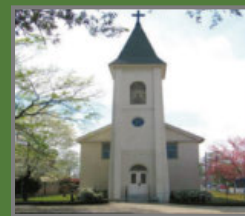
St. John The Baptist Catholic Church 800 Lurleen B Wallace Blvd N, Tuscaloosa, AL 35401 (Mailing: 733 James I Harrison Jr. Pkwy E; Tuscaloosa, AL 35405)

Saturday.....5:00 PM Sunday.....8:45 AM and 11:00 AM Nursery available (up to age 5) during 8:45 & 11 AM Masses Misa en Espanol (cada domingo) .....1:00 PM Monday-Friday.....6:45 AM Holy Days.....Check Bulletin Confession.....4:00 PM on Saturday