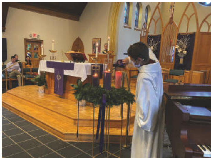
Advent Prayer Service for Children and Families