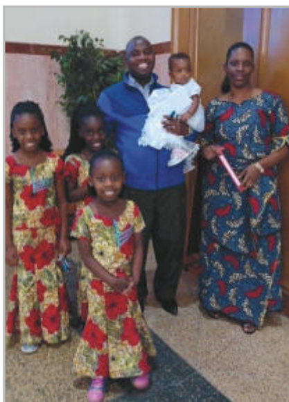
Sacrament of Baptism at Holy Rosary