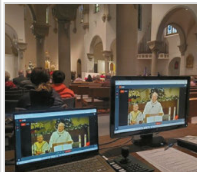
Photo left: Livestreaming Mass to those at home is one positive development over the last two years. As we are about to begin year three of the pandemic, livestreaming and Zoom gatherings are ways to bring people safely together.