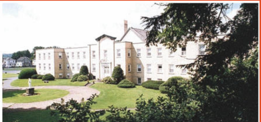
St. Joseph Monastery