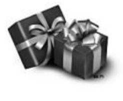
St. Mary's Ladies of Charity and St. Mary's parishioners made donations to support Catholic Charities' Immigrant and Refugee Center in Buffalo. Around 50 bags of donations went to help refugee families settling in Western New York.