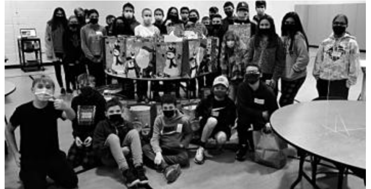
St. Mary's Faith Formation middle and high school classes donated over 60 bags of gifts for teens rescued by the Western New York nonprofit organization P.A.T.H. (People Against Trafficking Humans).