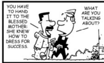
MARY, MOTHER OF GOD

If you would like to volunteer at one of the events, a detailed description of what that involves and sign-up sheets are on the table in the Gathering Space.