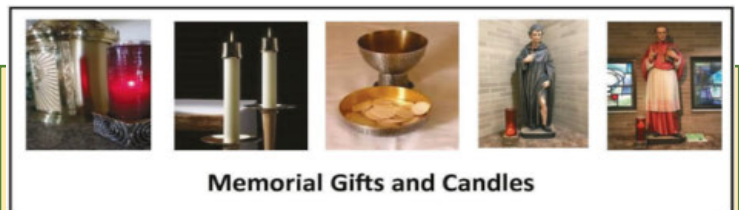
Memorial Gifts and Candles