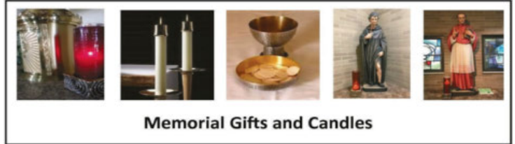
Memorial Gifts and Candles