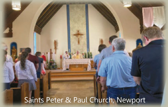
Saints Peter & Paul Church, Newport