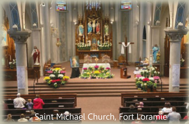
Saint Michael Church, Fort Loramie