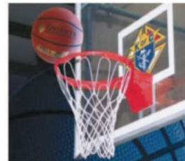
Free Throw Championship

(Eligibility is determined by age as of January 1, 2025)