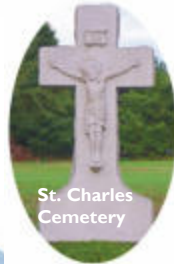
St. Charles Cemetery