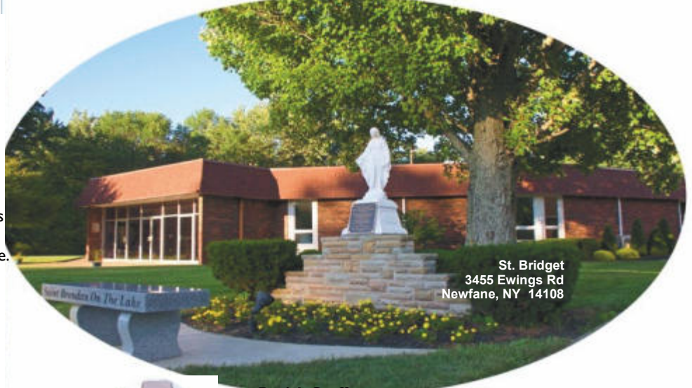
St. Bridget 3455 Ewings Rd Newfane, NY 14108

3455 Ewings Road PO Box 87 Newfane, New York 14108-0087 Phone 716.778.9822 Fax 716.778.8786 Website www.stbrendanonthelake.org Office Hours - Monday - Thursday 9:00am-4:00pm