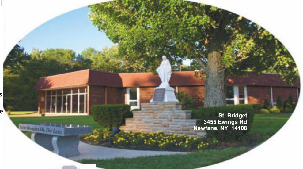
St. Bridget 3455 Ewings Rd Newfane, NY 14108

3455 Ewings Road PO Box 87 Newfane, New York 14108-0087 Phone 716.778.9822 Fax 716.778.8786 Website www.stbrendanonthelake.org Office Hours - Monday - Thursday 9:00am-4:00pm