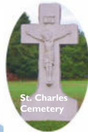
St. Charles Cemetery