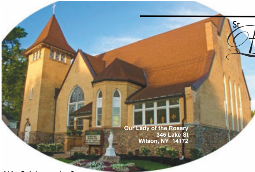
Our Lady of the Rosary 345 Lake St Wilson, NY 14172