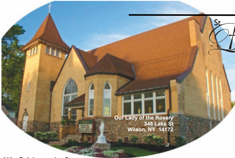
Our Lady of the Rosary 345 Lake St Wilson, NY 14172