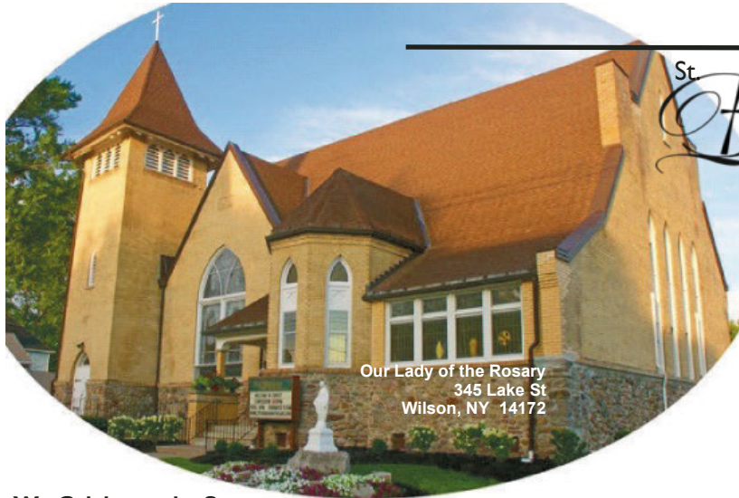
Our Lady of the Rosary 345 Lake St Wilson, NY 14172