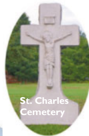
St. Charles Cemetery