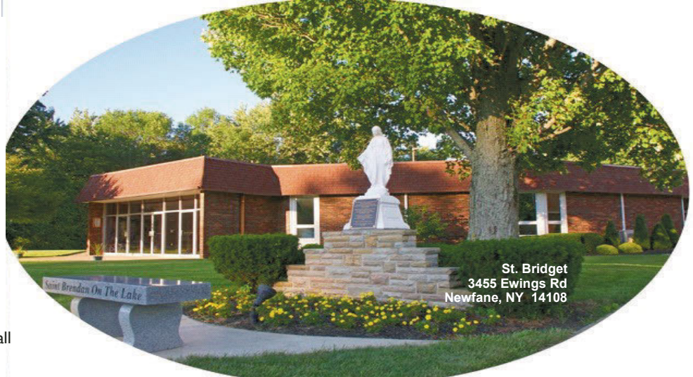
St. Bridget 3455 Ewings Rd Newfane, NY 14108

If you hear God's calling to serve the church as a priest, deacon, or to live a consecrated life, contact the Vocations Office in the Diocese of Buffalo at 716-847-5535.