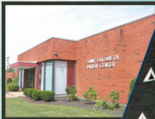
Saint Elizabeth Parish Center