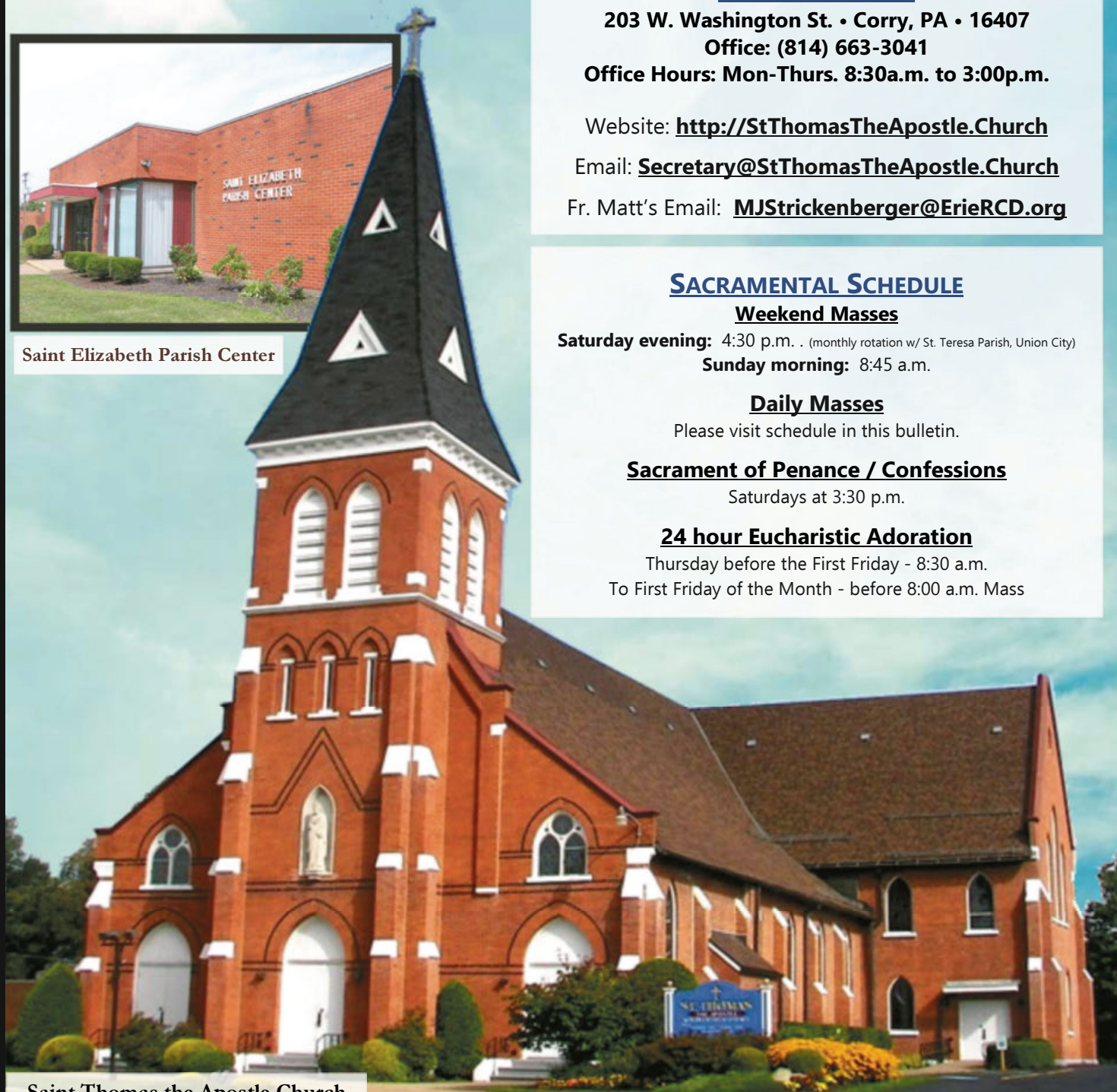
Saint Thomas the Apostle Church