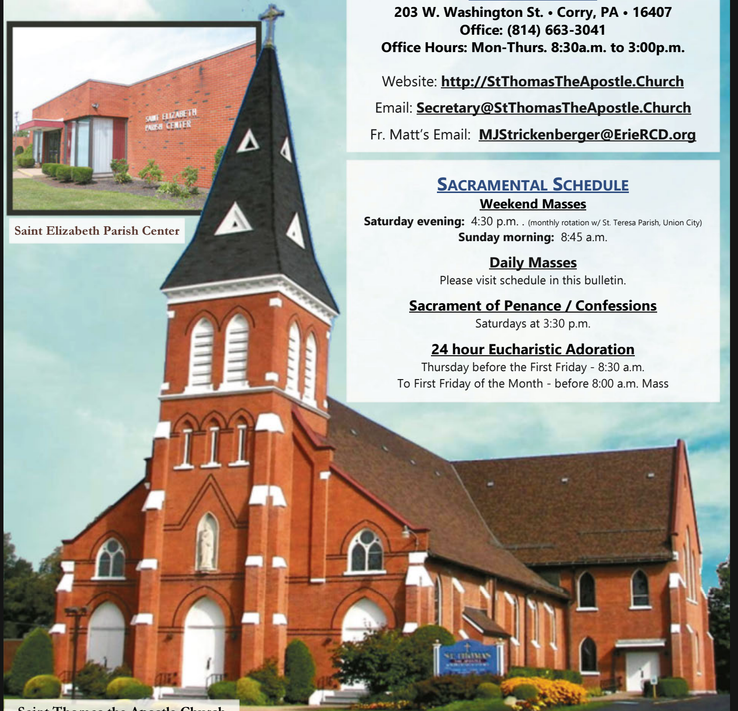
Saint Thomas the Apostle Church

To First Friday of the Month - before 8:00 a.m. Mass