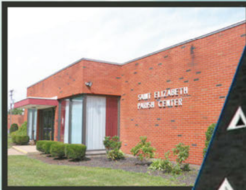
Saint Elizabeth Parish Center