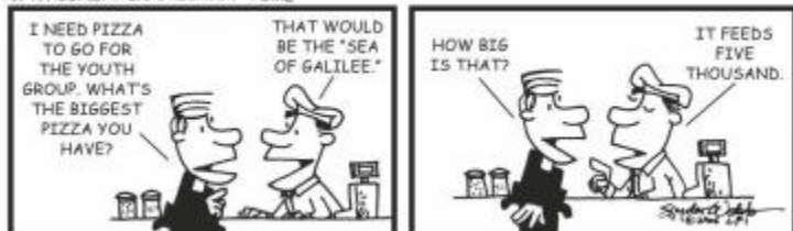
17TH SUNDAY IN ORDINARY TIME

Question for Kids: What loving gift could you give to another person this week?