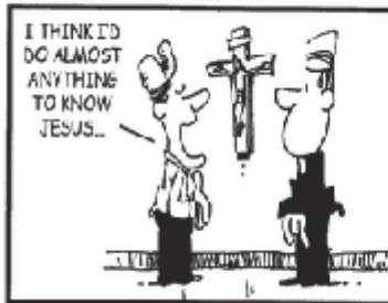
17th SUNDAY IN ORDINARY TIME