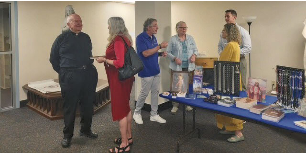
Sunday, June 29th