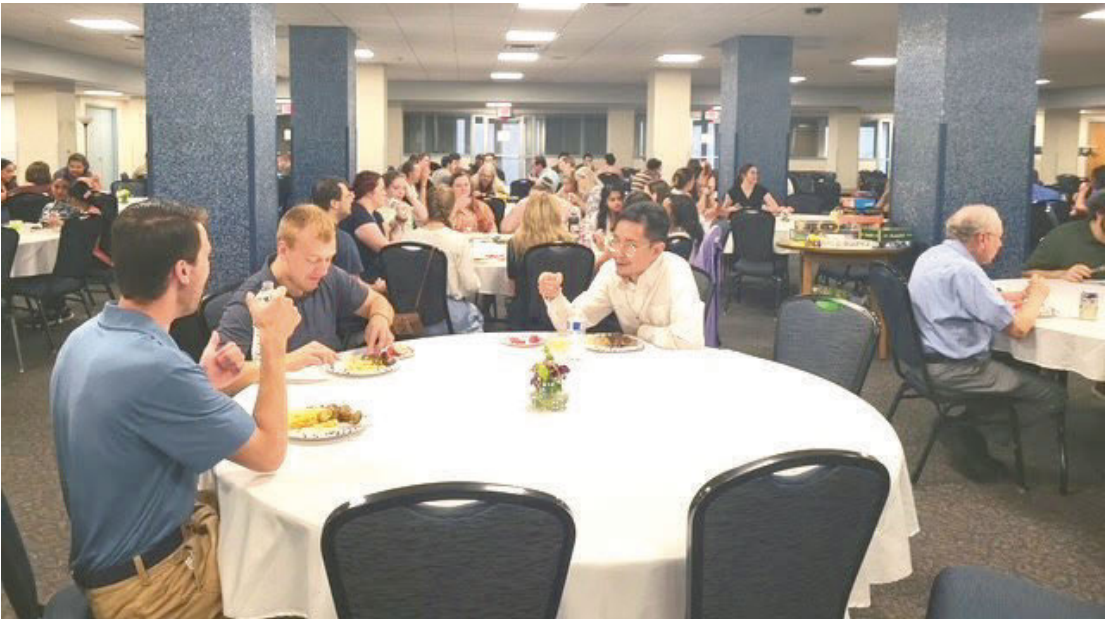
Celebrate the Feast of Saints Peter and Paul