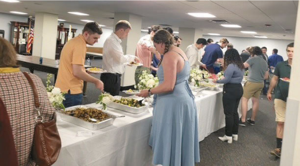
Saint Paul Cathedral Parish Young Adult Ministry