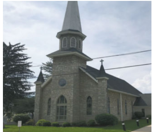
St. Gabriel 203 E. Arnold Ave. Port Allegany, PA 16743