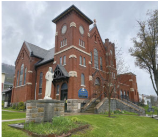
St. Elizabeth 307 Franklin Street Smethport, PA 16749