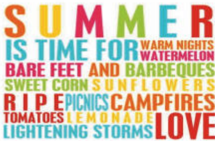
13 th SUNDAY IN ORDINARY TIME

“I know,” said the man, “but if there is anyone here more bored than I am, I’d like to meet him.”