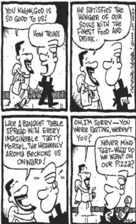
18 th SUNDAY IN ORDINARY TIME

Beyond being a time of worship, we should also remember that Sunday is intended to be a day of rest, when we make time for recreation, for sharing meals, and enjoying the company of friends and family. Sunday is given to as a day to take stock of and enjoy the blessings that God has given us (see Catechism of the Catholic Church , no. 2187). Pope Francis reminds us, “The day of rest, centered on the Eucharist, sheds its light on the whole week, and motivates us to greater concern for nature and the poor” ( Laudato Si' , no. 237).