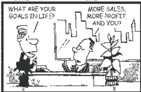
31st SUNDAY IN ORDINARY TIME

A CARD PARTY will be held at St. Alphonsus Parish Hall in Wheeling on November 14th from 1:00 to 3:00 p.m. Cost is $10 per seat. For reservations call Barb at 304-243-0604 or the church at 304-232-4353.