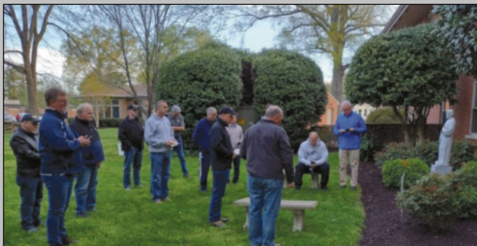
In this photo MOSJ members are praying the 7th Station, "Jesus Falls the Second Time" located by the statue of St. Joseph.

The MOSJ recite this prayer at the end of their weekly meetings.