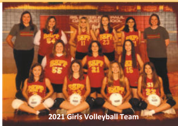
2021 Girls Volleyball Team