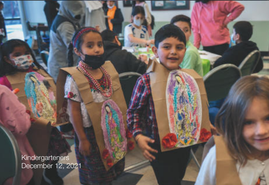
Kindergarteners December 12, 2021