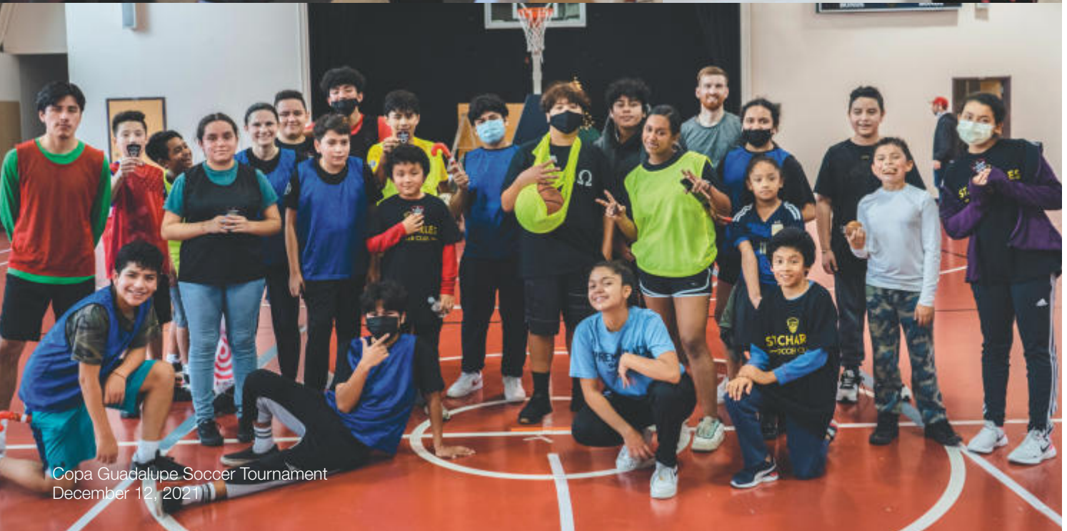
Copa Guadalupe Soccer Tournament December 12, 2021