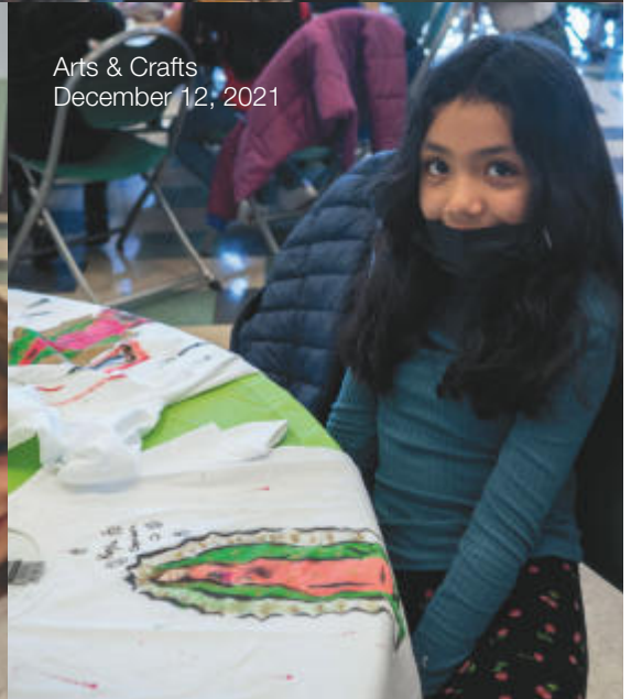
Arts & Crafts December 12, 2021