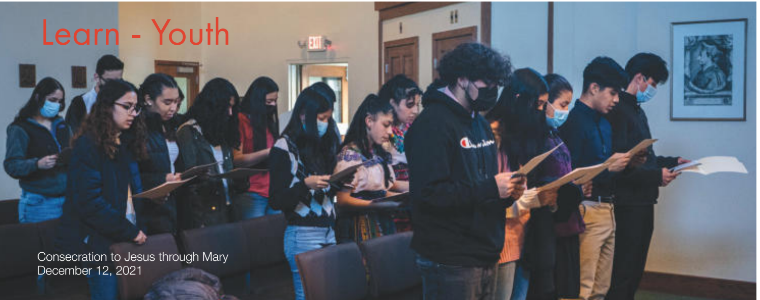
Consecration to Jesus through Mary December 12, 2021