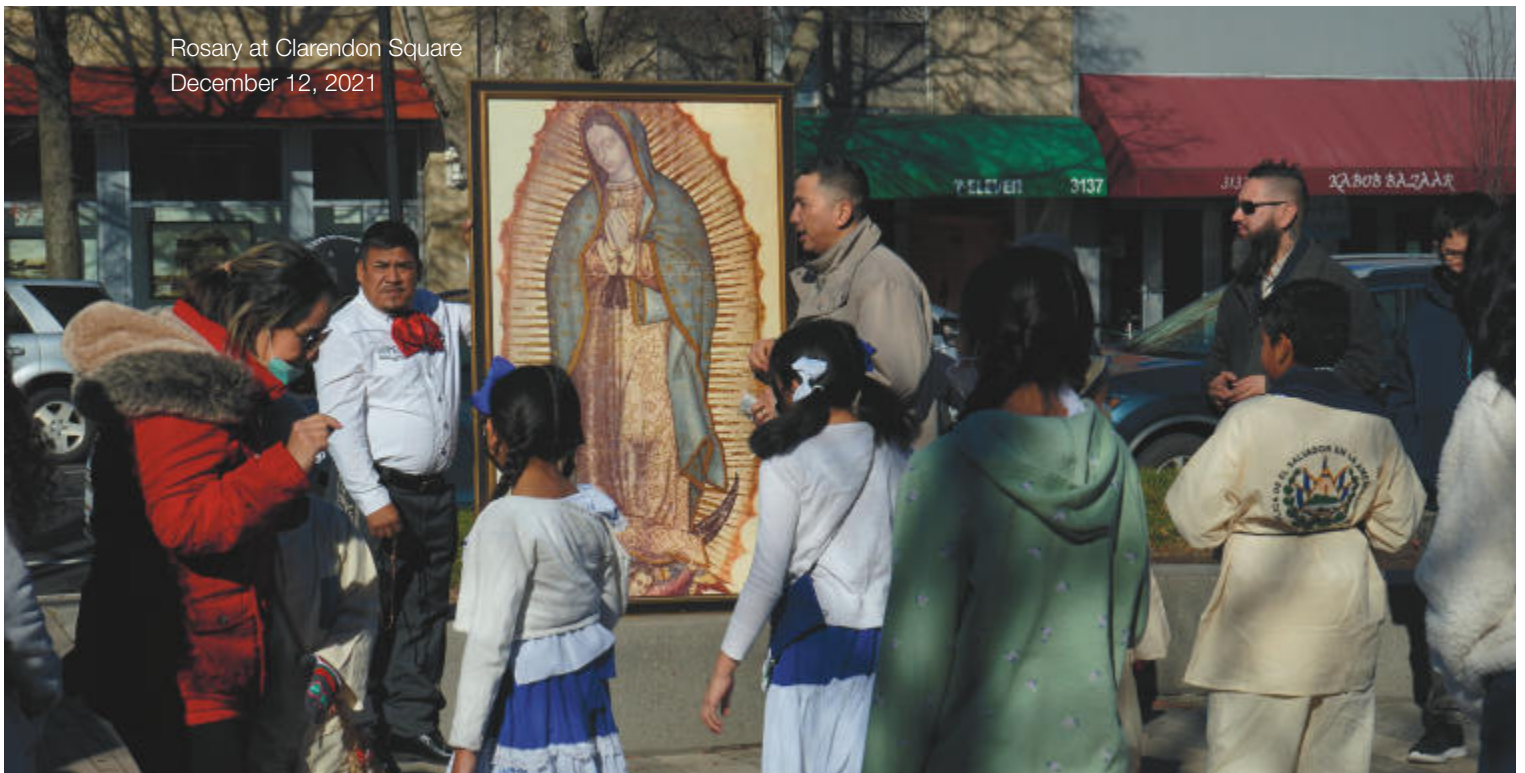
Rosary at Clarendon Square December 12, 2021

After all Masses on December 18 and 19, Haiti Committee members will be outside Benedict Hall selling Haitian coffee, chocolate and art work and offering the opportunity to purchase chickens and goats for our sister parish families. Please come by!