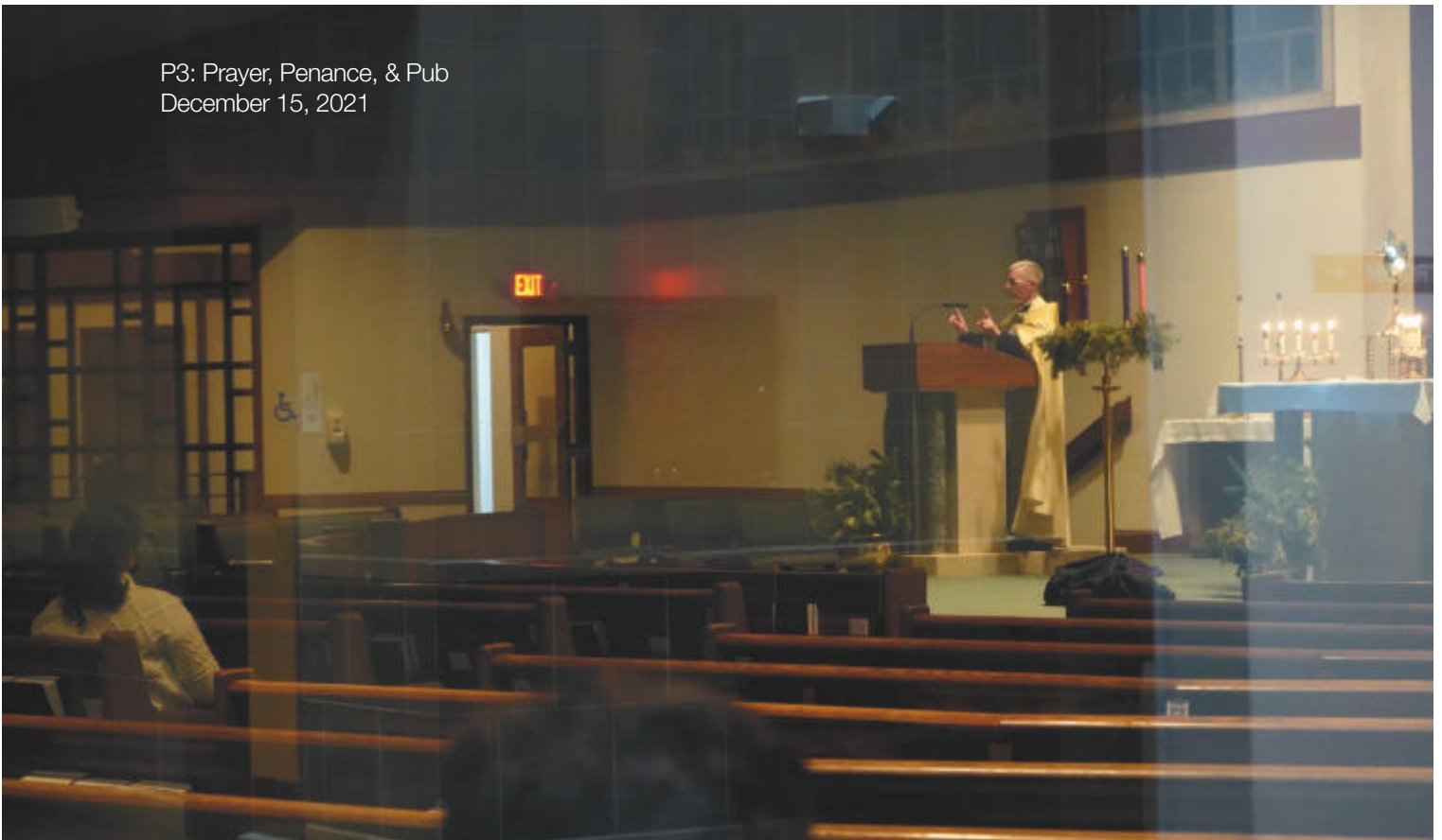
P3: Prayer, Penance, & Pub December 15, 2021

The 49th Annual March For Life takes place on Friday, January 21st. St. Charles will be celebrating a Pro-Life Mass at 9 AM, followed by breakfast in Benedict Hall. After breakfast, we will head down to the March together via Metro (please bring your Metro card if you have one).