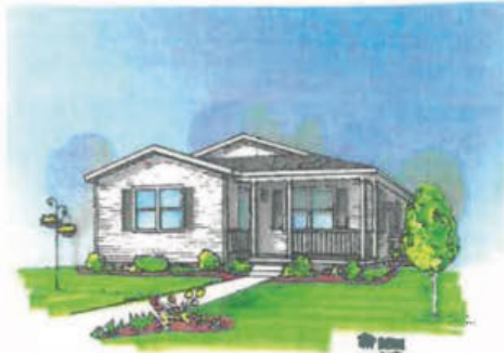
85 Marion Ave SE, Massillon