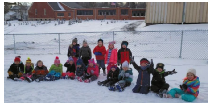
*Preschool 4 enjoying the snowy playground on January 12, 2022.