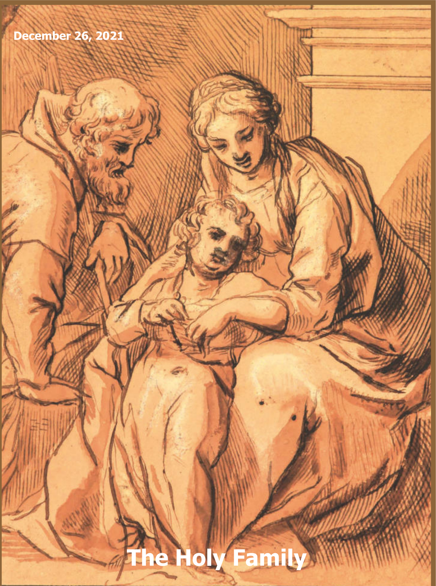
The Holy Family